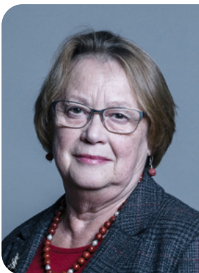
Baroness Cathy Bakewell Vice-Chair of the All Party Parliamentary Group on Gypsies, Travellers and Roma

The guide is based on research funded by the Joseph Rowntree Foundation, undertaken by De Montfort University in Leicester and published by the Chartered Institute of Housing in 2016. 1 This showed how vital it is for existing sites to be well managed, before seeking political and public support for plans to build new sites. The 2016 study identified a list of essential ingredients for effective site delivery and management, which this guide amplifies and illustrates with successful case studies from across the UK.