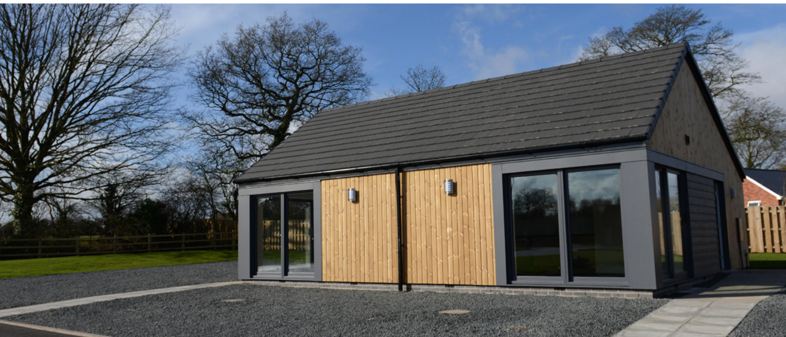
Good planning pays dividends – attractive homes using materials that complement the surrounding landscape..

Broadland Housing took the strategic decision to apply to the Affordable Homes Programme to fund an additional site for Gypsies and Travellers. In January 2021 the group secured £806,000 in grant from Homes England for a scheme in Norwich to provide 13 pitches. Developed as a partnership with Norwich City Council, the new site had a ten-month timetable for completion with particular emphasis on good design and build quality.