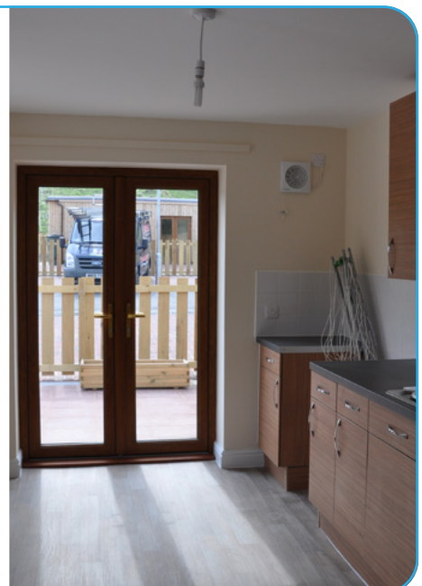
Utility room at Elim Housing's Carrswood View site in Bath.

Rooftop puts and keeps residents at the heart of its approach, from initial site concepts stage through to delivery and management. To keep people engaged, earn their trust and learn lessons the organisation involves end users in site design, taking care to consult about and include customers' knowledge and preferences. Asking children about the design of play areas is especially important. Developing good links with people before they become tenants is invaluable in building longer term sustainable and professional relationships with occupiers, their families and visitors.