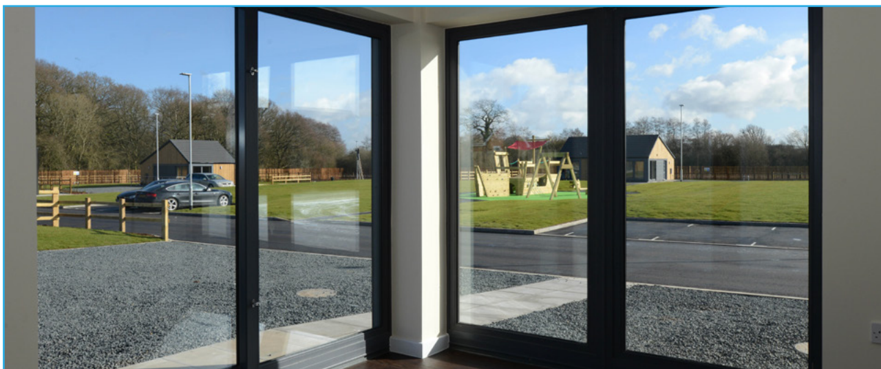
Interior and view of shared space and amenities at Gables Close.

Rents are in line with local bedsit accommodation and are sufficient for the scheme to break even in 23 years after completion. Total scheme costs were £1.2 million (including £960,700 works costs), funded by Homes and Communities Agency grant of £575,000 and a Rooftop loan of £635,739.