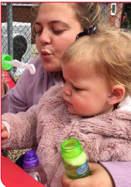
Brooks Green – building a stable, successful and happy community.