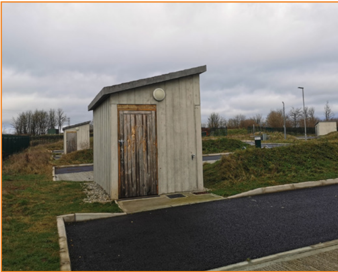
Safe parking and toilet facilities at South Treviddo.

This site has many elements of best practice in design. It's based on the recommended circular design, with occupiers' safety and security a high priority. A closed circuit television system sends a continuous live feed to a monitoring station, and there's adequate and appropriate lighting throughout. The site is located near to a dual carriageway, but careful planting design creates an effective noise break and privacy.